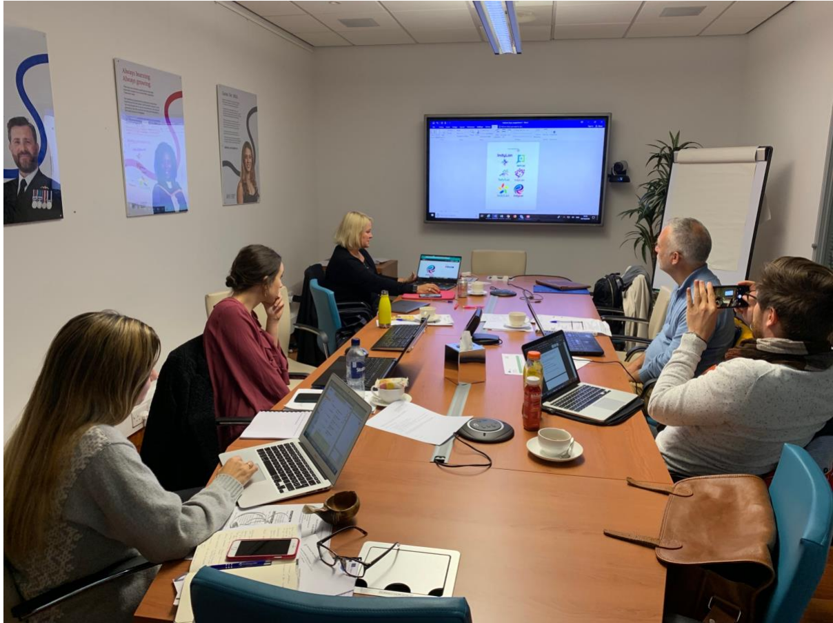
Choosing a project logo