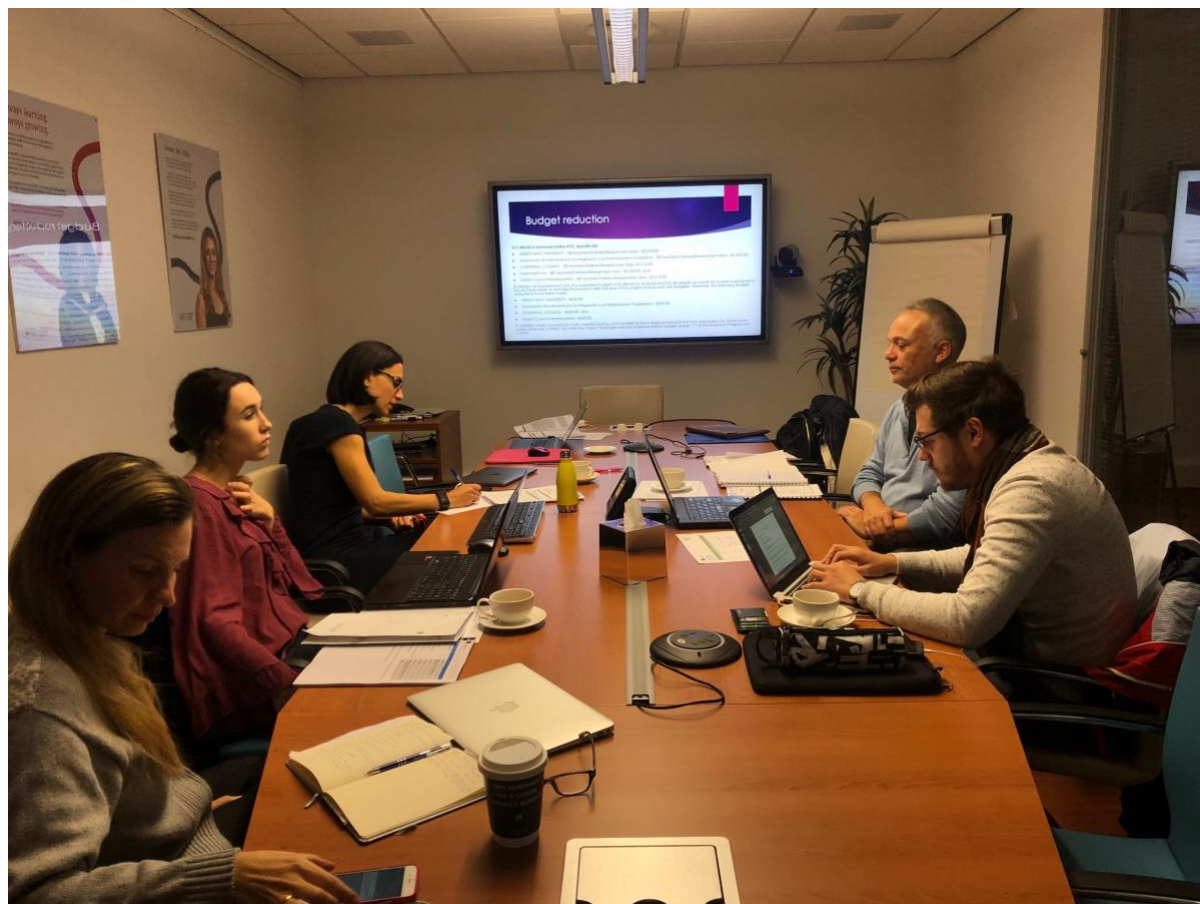
Discussing the budget